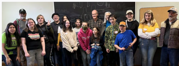
Youth Mentoring participants enjoyed hiking and geocaching at Eagle Bluff Educational Center.

What do you do when someone you know is doing something wrong, like cheating, stealing, or smoking?