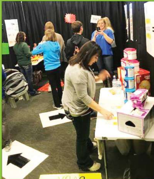
Students have fun maneuvering their way through the various rooms in the Teen Maze.

The coalition would like to thank these partners: Families First LLC, Parent Share & Support, Fayette County Sheriff's Office, West Union PD, Fayette PD, Riverview Center, Northeast Iowa Community Action, Friends of the Family, Iowa State Patrol, IowaWORKS, Northeast Iowa Behavioral Health, Iowa State Extension, Gundersen Palmer Community Health, and UnityPoint Health. Many sponsors also made this event possible. Thank you to the community for stepping up and creating an interactive and impactful event for students in Fayette County. ■