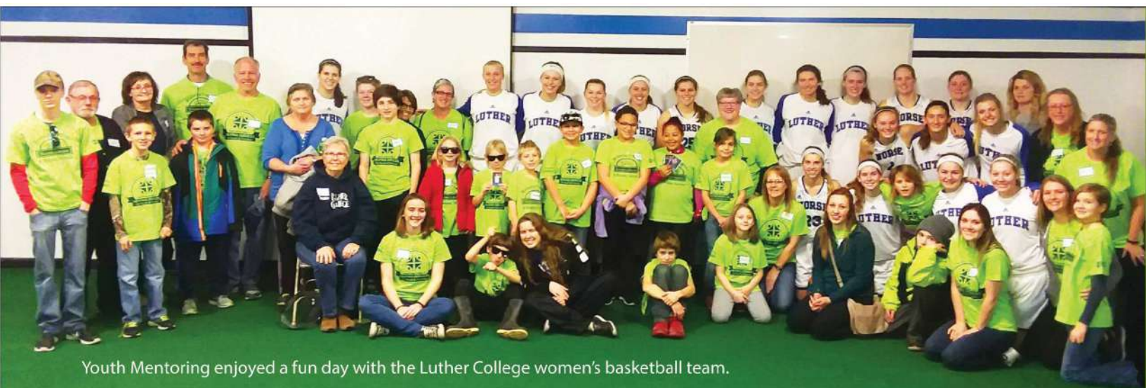
Youth Mentoring enjoyed a fun day with the Luther College women's basketball team.