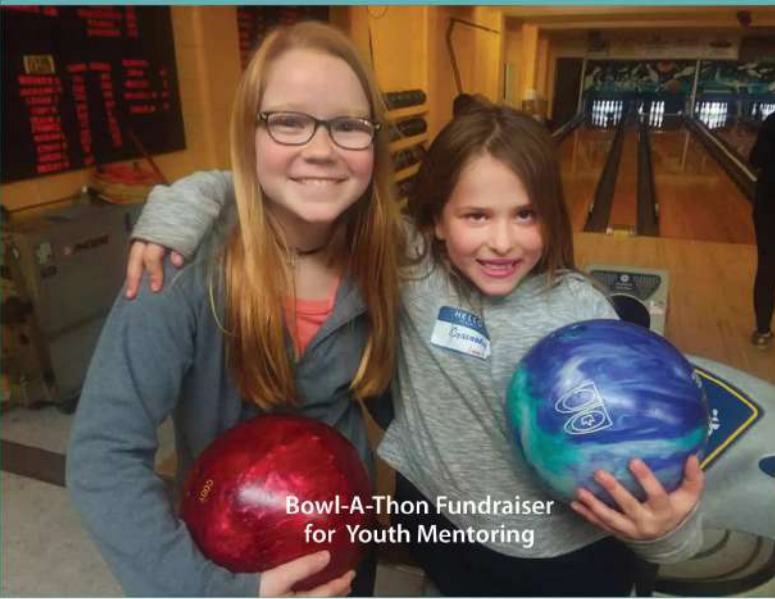
Bowl-A-Thon Fundraiser for Youth Mentoring