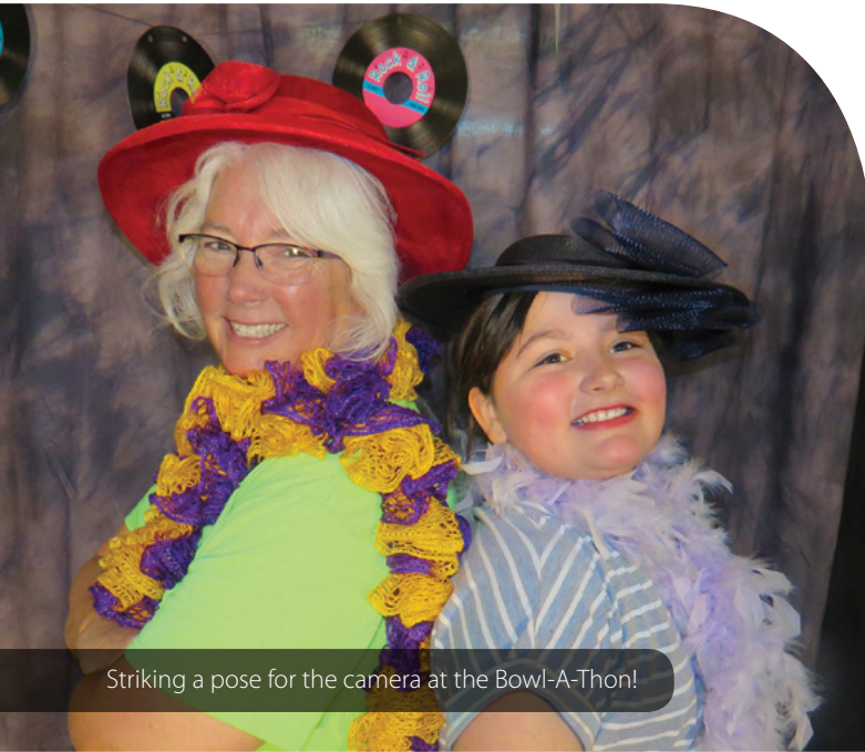
Striking a pose for the camera at the Bowl-A-Thon!

Update your contact info at info@helpingservices.org