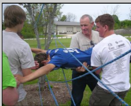
DJ gets passed through the spider web