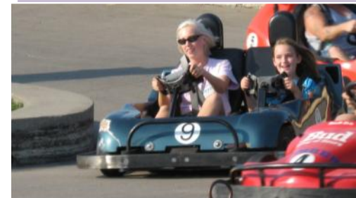
Middle School Mega Sale. Thank you DMS!

Enclosed with this mailing is a permission slip that all mentees must have filled out and bring with them the day of the event. Funding for this event is from proceeds of the Decorah